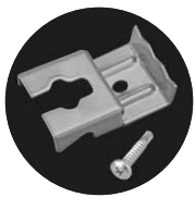
Round Lock Clamp