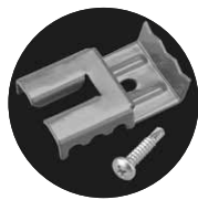
Square Lock Clamp